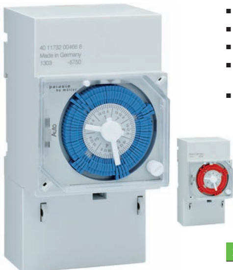
13x 120 (daily program)